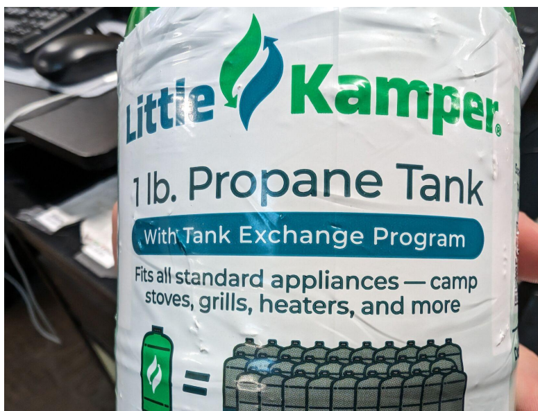
Reusable Propane Tank